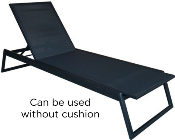
Can be used without cushion