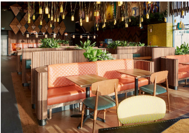
Nando's, Reading, United Kingdom